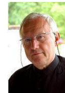
France and Europe