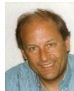
France and Africa