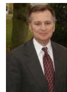
USA and Canada