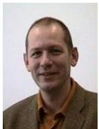
Belgium And Europe