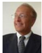
France, Europe and China