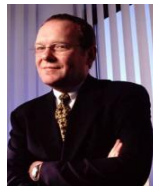
UK and Europe