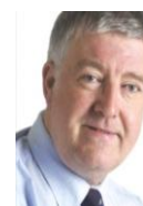
UK and Europe