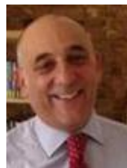
UK and Europe